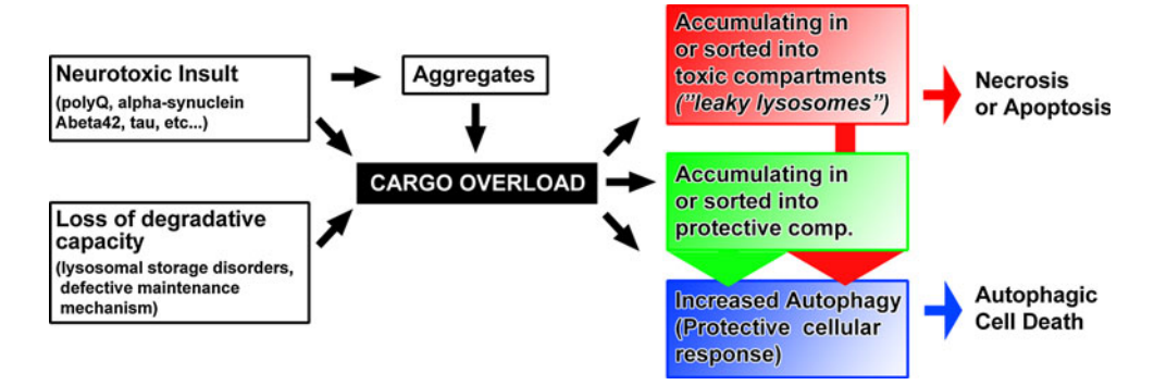
Fig. 1 Aberrant membrane trafficking can be the cause or effect of intracellular cargo overload. Accumulation of different disease proteins can lead to a 'cargo overload' phenotype in a manner similar to loss of normal degradative capacity and maintenance. Aberrant cargo can be the cause of membrane trafficking defects by accumulating in toxic compartments ( red ) or protective compartments

Endocytosed material traffics through transport vesicles to early endosomes which mature into multivesicular bodies (MVBs) or late endosomes and finally fuse with ER/Golgiderived vesicles that contain degradative machinery to form lysosomes (Fig. 2). Phagocytosis and autophagy provide alternative entry points for larger molecules and organelles.